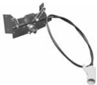
RCS-10R Field Mounting Kit