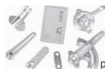
Damper Accessories - pg. 9