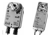
Actuators - pg. 10-11